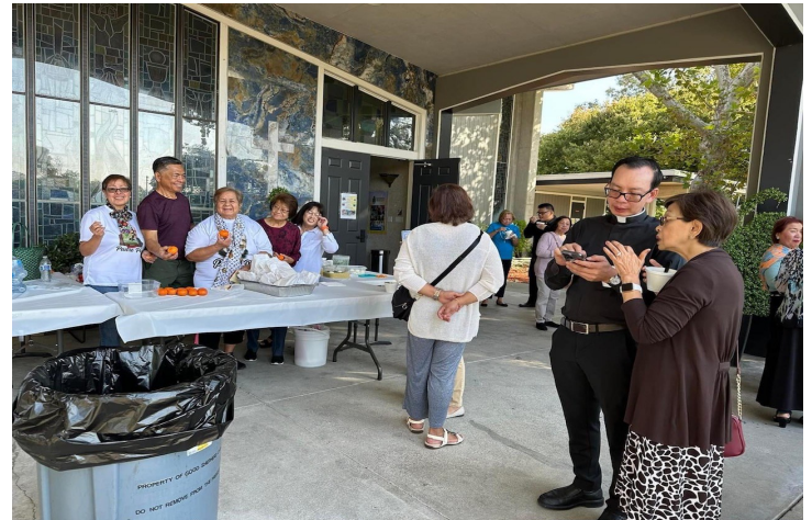
Reception after Healing Mass 8/31