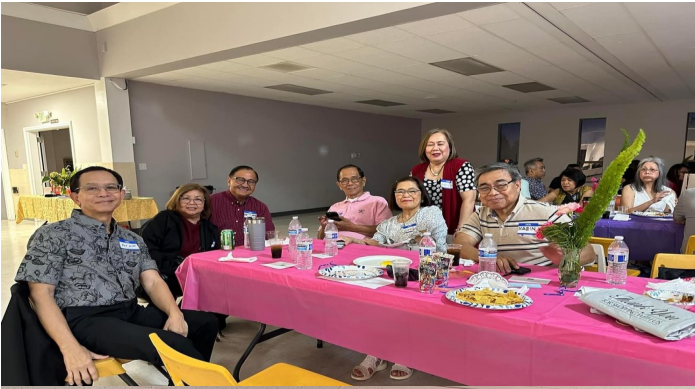
Good Shepherd's Choirs having their annual appreciation dinner 8/31