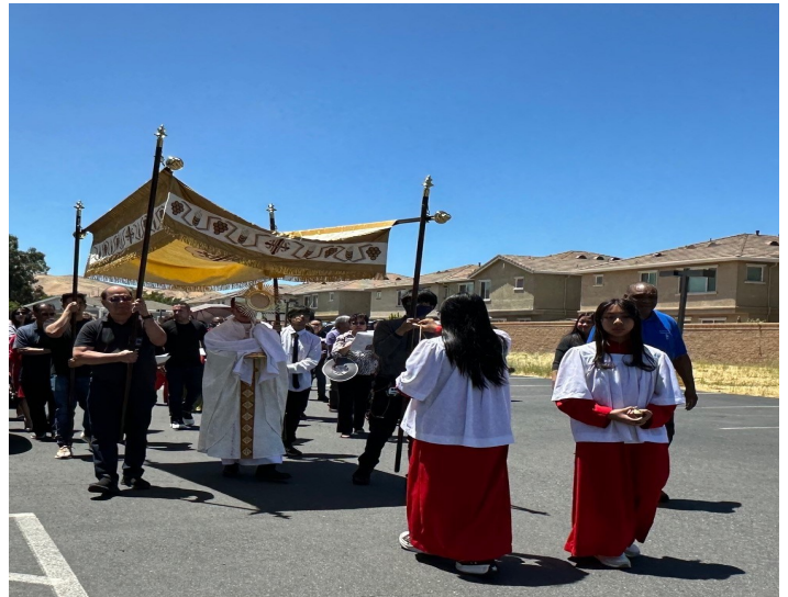
Eucharist Procession on the Feast of the Corpus Christi, June 02, 2024