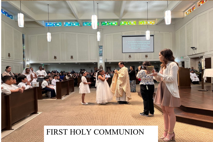
FIRST HOLY COMMUNION