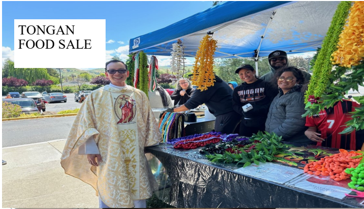
TONGAN FOOD SALE