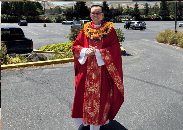
11th Anniversary as a priest. Thank you for prayers and support. God is good. All the time!