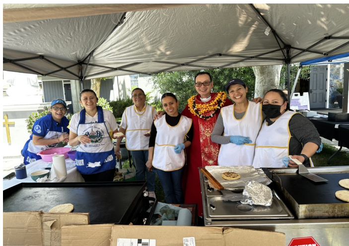
Armanda Blanca Food Sale 5/19/24