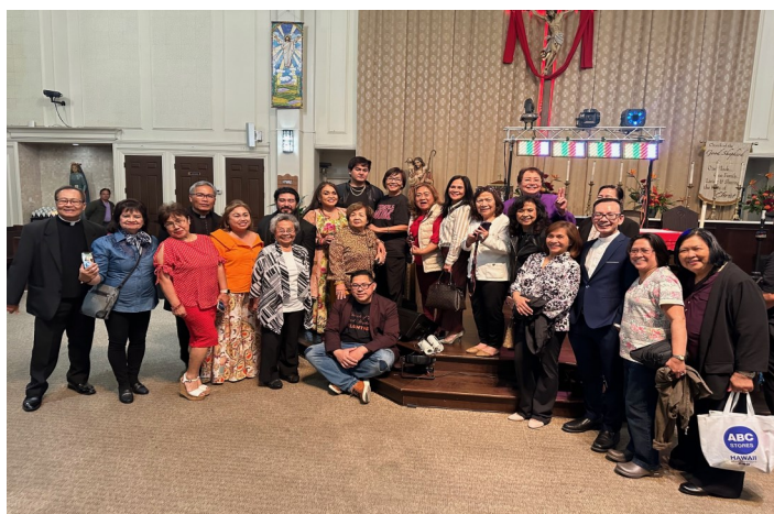
Music Concert 5/18/24