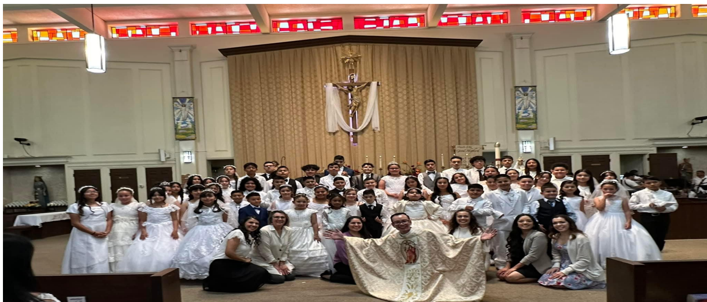
1st Holy Communion 5/18/24